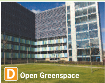
D Open Greenspace