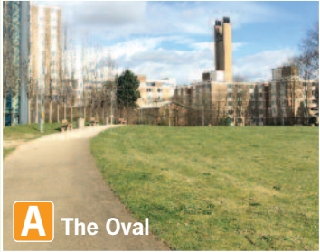
A The Oval