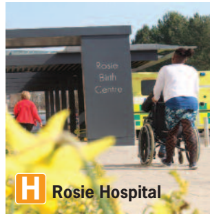
H Rosie Hospital

Cambridge University Hospitals NHS Foundation Trust and its campus partners believe passionately in the Cambridge Biomedical Campus being a healthy place to work and benefit from. Live and Work Well is our campus-wide campaign of events, promotion and activities designed to support, educate and improve the health of our campus community. You can find out more by visiting www.cuh.org.uk/liveandworkwell