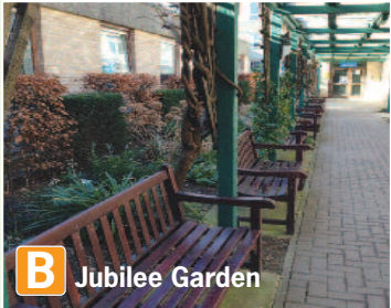
B Jubilee Garden